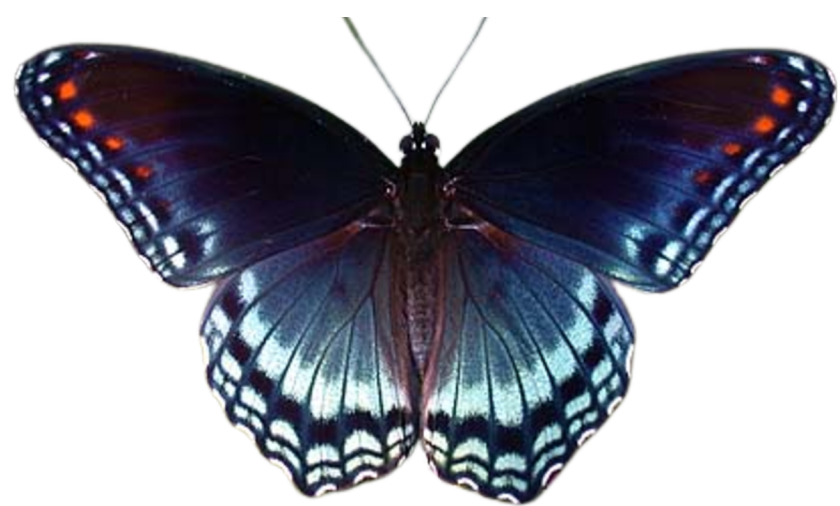
RED SPOTTED PURPLE