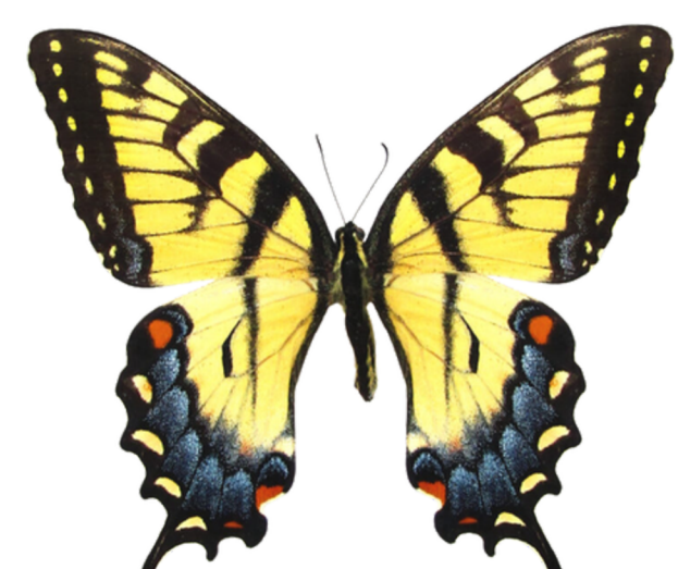
EASTERN TIGER SWALLOWTAIL